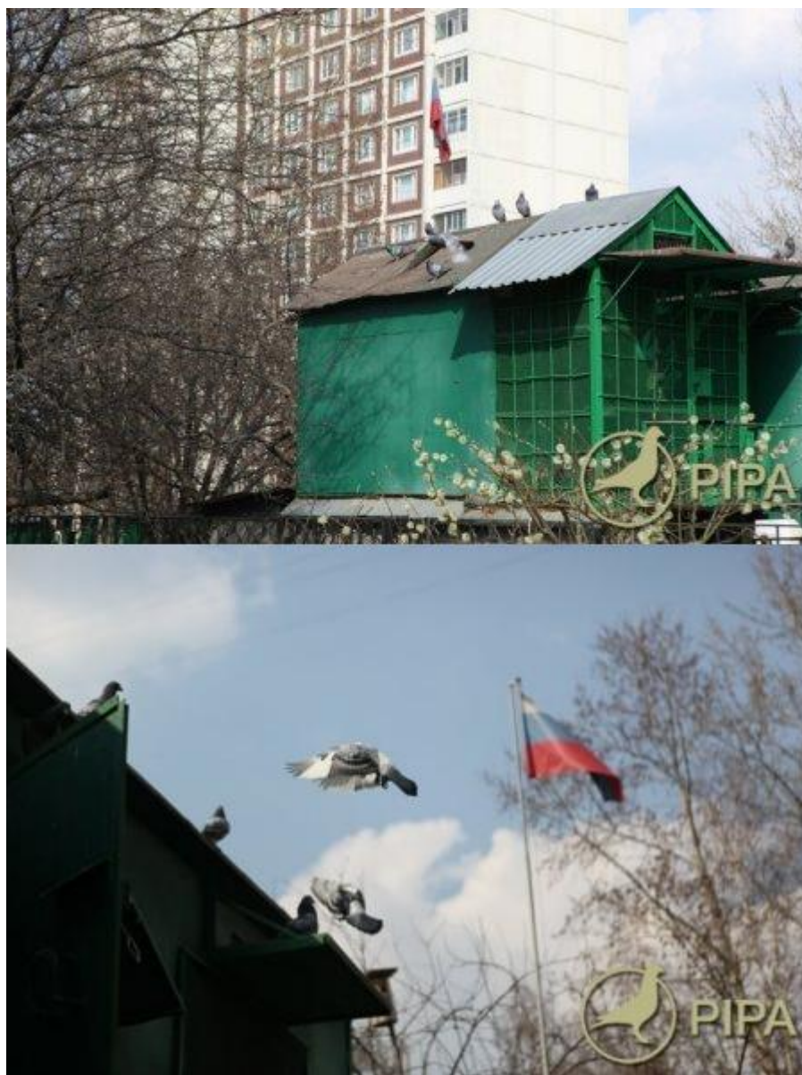
The lofts of Sergey Stegantsev

But success or ‘fame’ can take their toll, or have dire consequences if you will. A few years ago, in April 2006, Sergey’s pigeon loft was set on fire and all the pigeons were killed. It is unfortunate to experience this level of jealousy and criminality, but it does indeed happen. Nowadays all the lofts are guarded by an enormous guard dog which, when he stands on 2 legs, is bigger than the average person. Not much chance of the vandals striking again.